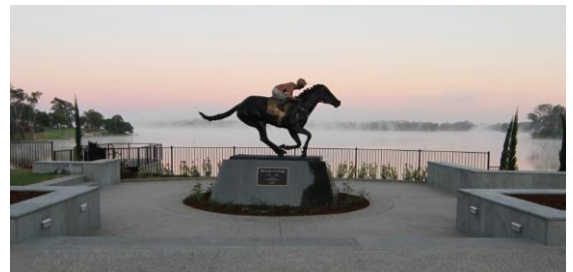
Statue of Black Caviar - Black Caviar was born on 18 August 2006 at Gilgai Farm in Nagambie, Victoria