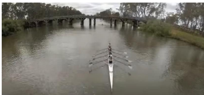
Goulburn Rowing Regatta Nagambie near - Chinamens Bridge