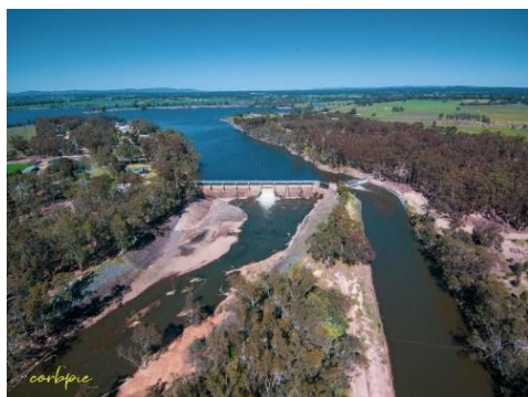
Historic Goulburn Weir

12.30pm Lunch at Historic Tahbilk Winery, with a discussion where to meet next time (Swan Hill)?