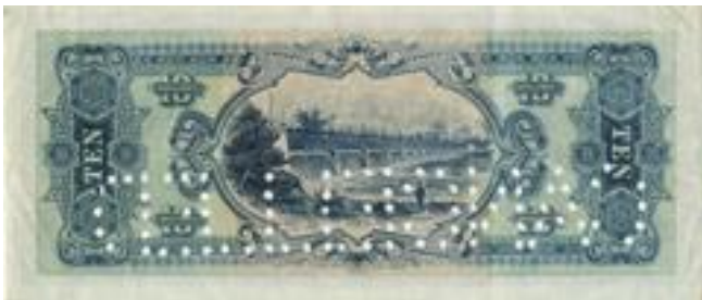
Goulburn Weir was on the Australian half sovereign and ten shilling banknotes from 1913 until 1933

An optional pre-weekend ‘meet-and-greet’ is arranged for Friday night in the ambience of the Nagambie Brewery & Distillery.